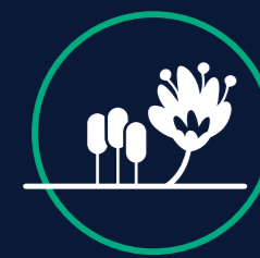
BIODIVERSITY, 750 TREES, 40,000 SHRUBS