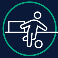
MULTI-USE GAMES AREA