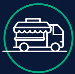
CENTRAL PLAZA, POP UP FOOD OFFERING