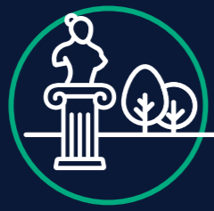
PUBLIC ART INSTALLATIONS