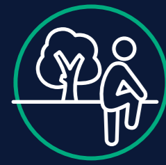
OUTDOOR EXERCISE AREA